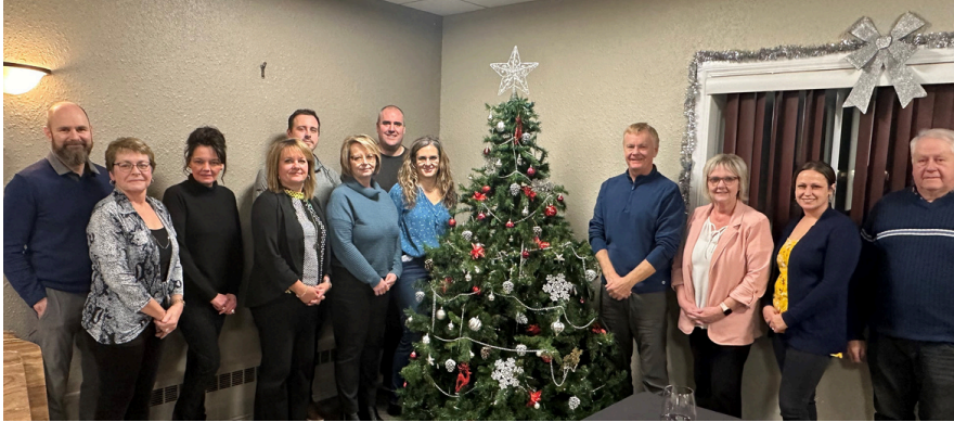
2023 AGM BOARD OF DIRECTORS & STAFF

In the upcoming year the Foundation will give $211,000 back to the community. The Community Foundation of Swan Valley is proud to support the recipients of the awards, and praises the efforts made by the community at large to make the Swan Valley a better place.