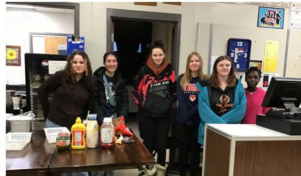
SVRSS YOUTH IN PHILANTHROPY

SVRSS Tigers Football (SVSD). - Team Equipment ($1,000)