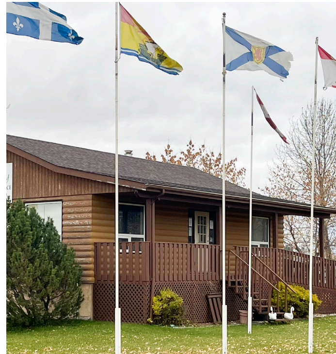
The Community Foundation of Swan Valley proudly shares office space with the Swan Valley Chamber of Commerce in the Tourism Building located on the corner of Main Street and Highway 10 North.