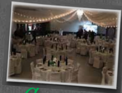
Gala - 2019