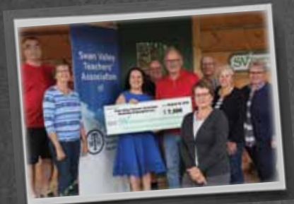
Swan Valley Teachers Assoc.